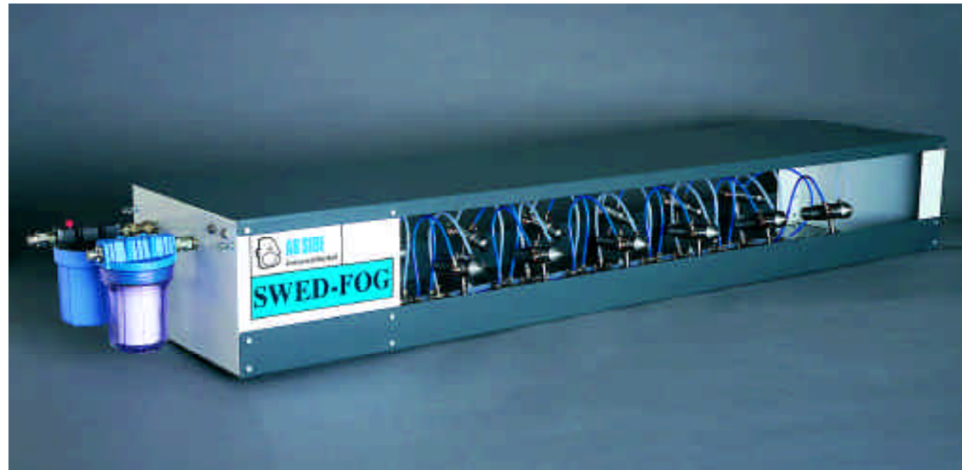
SIBE SWED-FOG® LFV-S4-6-8-10-12D unit system. The LFV-S-12D is shown above.