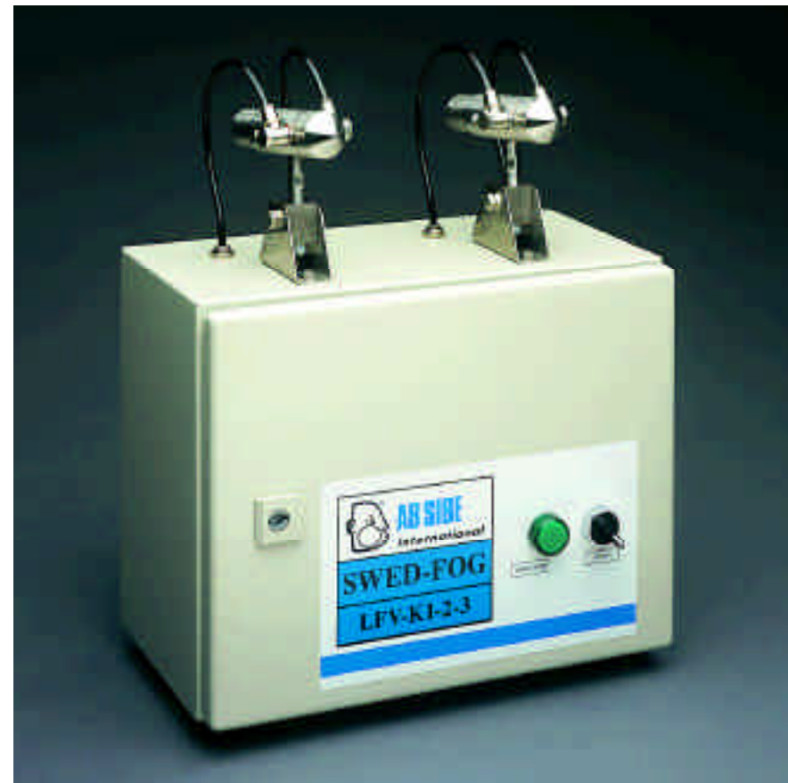
SIBE SWED-FOG® LFV-K1-2-3 compact system. The LFV-K2 is shown above.