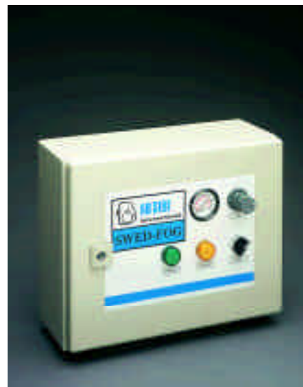
SIBE SWED-FOG® LFV nozzle system for unrestricted layout.